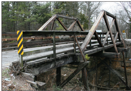
Hammitt Street Bridge

CSX is the owner of the old Hammitt Street Bridge, and will continue to be responsible for the maintenance, and ultimately, the removal of the bridge.